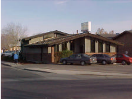
WSSG Building 2356 Nth 7th Street